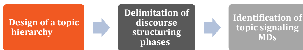
Figure 1. Coding procedure